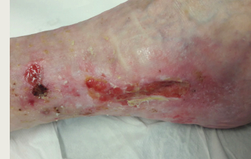
3 weeks post debridement