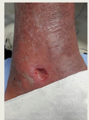
After use of Prontosan® Debridement Pad