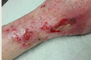
After a single debridement